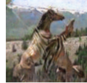
P_{0.5}(w, f) \rightarrow Q_{12}(w, f)