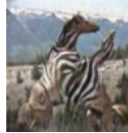
Q_{12}(w, f) \rightarrow P_{0.5}(w, f)