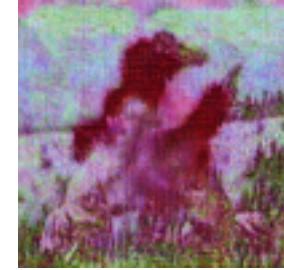
P_{0.5}(w) \rightarrow Q_8(w, f)